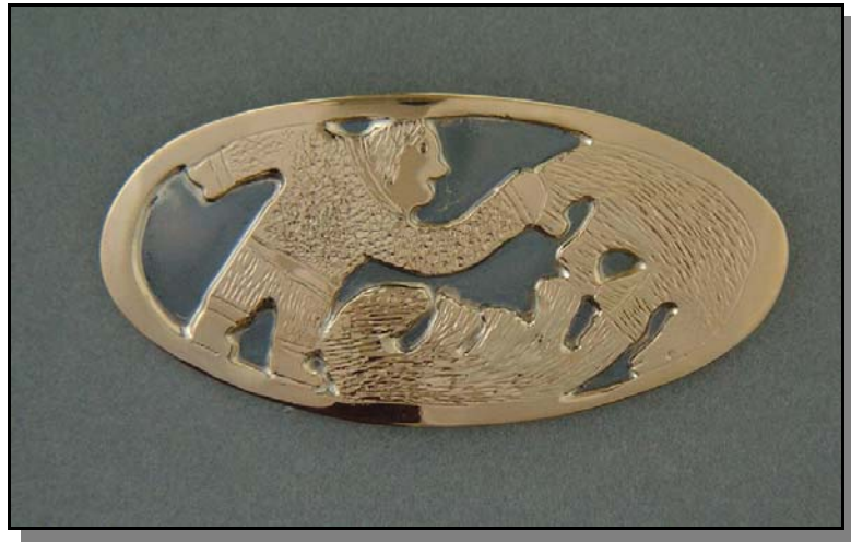
Kautyayuk, 2003 14k gold, sterling 5 x 2.5 cm