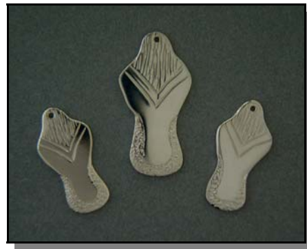
Women with Amautik, 2003 Sterling 2 x 1 / 3 x 1.5 / 2 x 1 cm