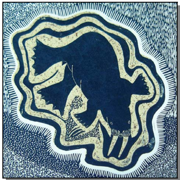
Aiviq, 2003 Linocut, chine cole