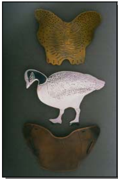
Untitled Brooches, 1999 Brass, sterling, copper Approx. 4 x 4 cm each