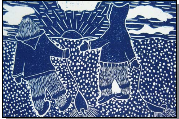
Umianguagtuuk, 2003 Linocut