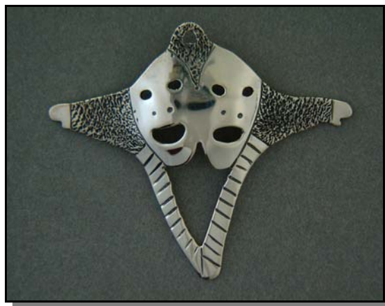
Two Faces, 2003 Sterling, pendant 4.5 x 4 cm