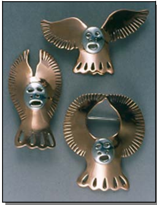
Ancient Voices, 1999 Copper, sterling, brooches, Approx. 5 x 3.5 cm each