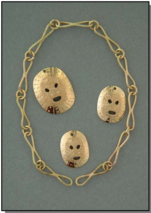
Ancient Masks, 2003 14k gold 1 x 1.5 / 2 x 1.5 / 1 x 1.5 cm