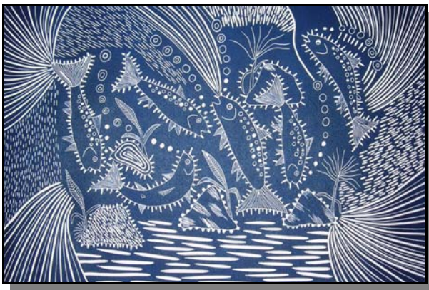
School of Fish, 2003 Linocut