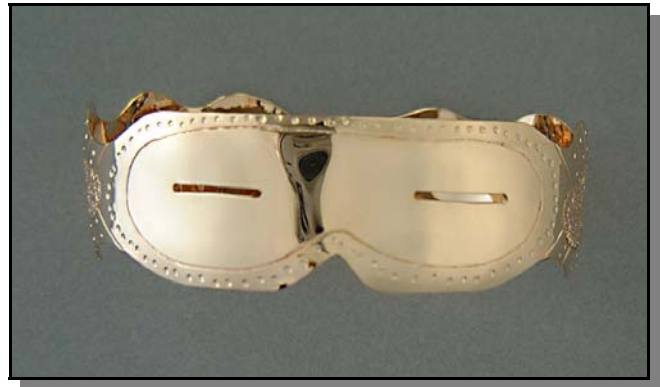
Snow Goggle, 2003 14k Gold 6 x 4 x 2 cm