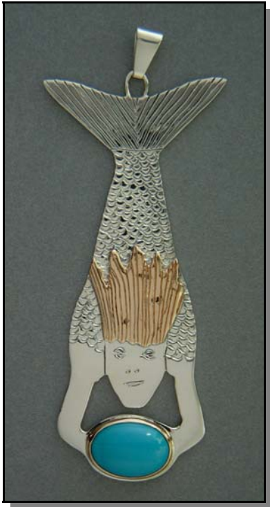
Talilayuk, 2003 Sterling, 14k gold, turquoise 6.8 x 3.2 cm