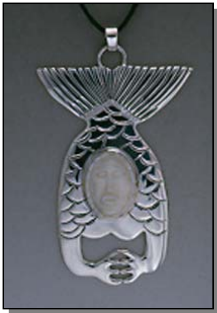
Sedna Pendant, 1999 Sterling, ivory 5.5 x 3.5 cm