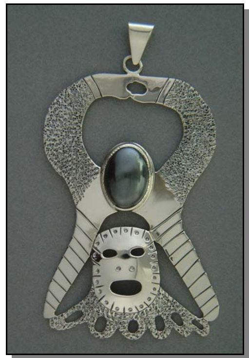
Moon Shaman, 2003 Sterling, hematite 6.5 x 4 cm