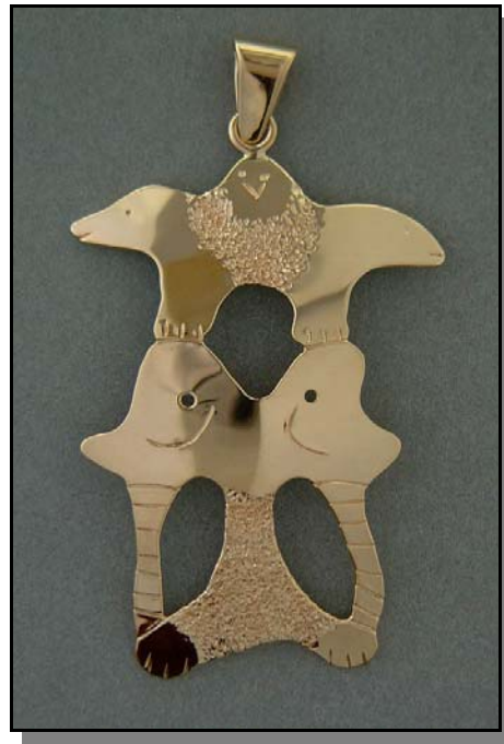
Polar Bear Fish Head, 2003 14k gold 3 x 5 cm