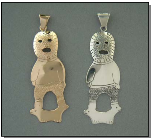
I am on Top, 2003 14k gold / sterling 6 x 2 cm