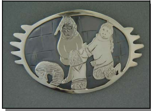
Kautayuk Brooch, 2003 Sterling 6 x 4 cm